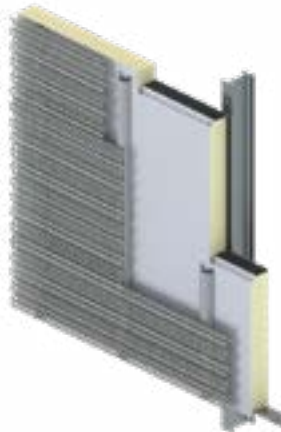
Sandwich horizontal, profile vertical