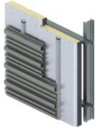
Sandwich vertical, profile vertical