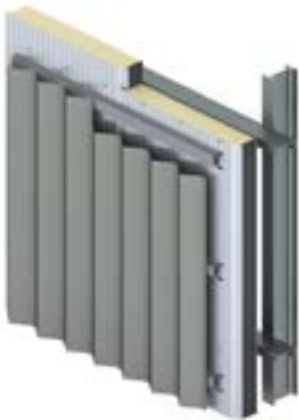
Sandwich vertical, profile horizontal